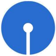
State Bank of India